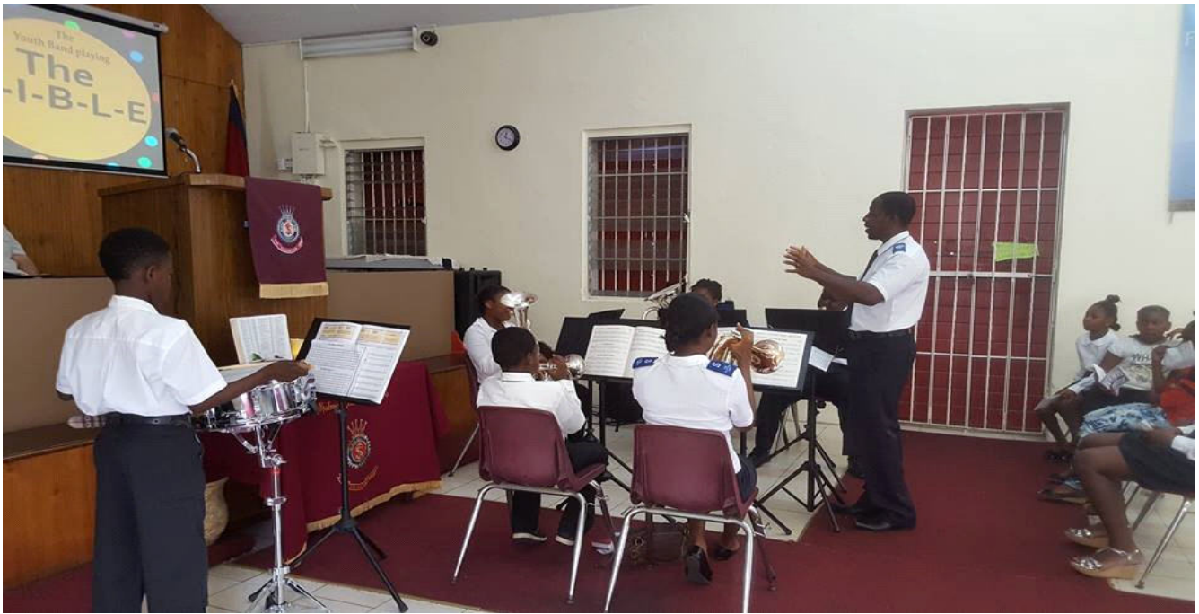
The First performance of the St. Thomas Corps Youth Band and Chorus